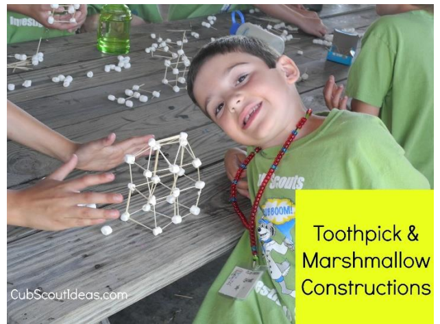
What can your Cubs dream up to build?