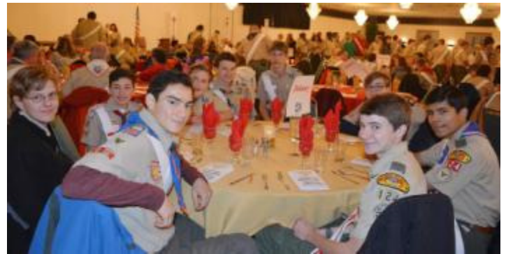
Dulaney Brothers enjoying themselves at the annual Nentico Lodge Banquet