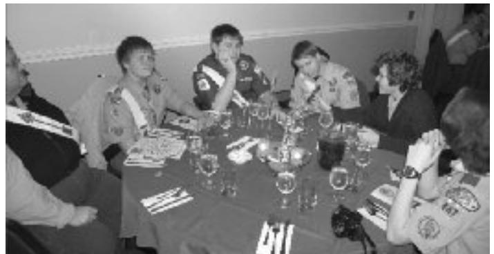
4 Rivers Chapter Table