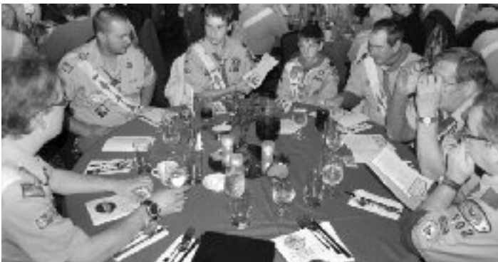
Dulaney Chapter Table