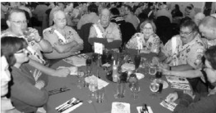
Carroll Chapter Table