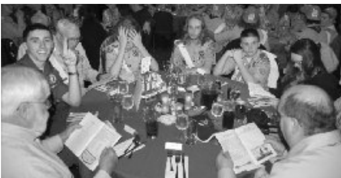
Chesapeake Chapter Table