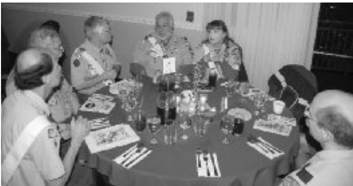
National Pike Chapter Table

Baltimore Area Council 701 Wyman Park Drive Baltimore, MD 21211