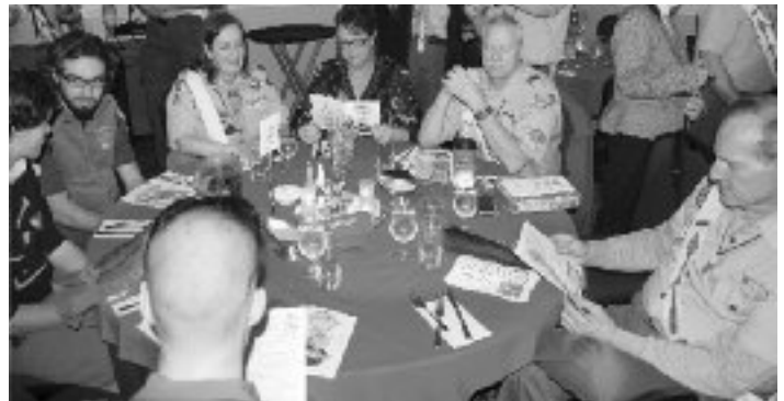
Arrowhead Chapter Table