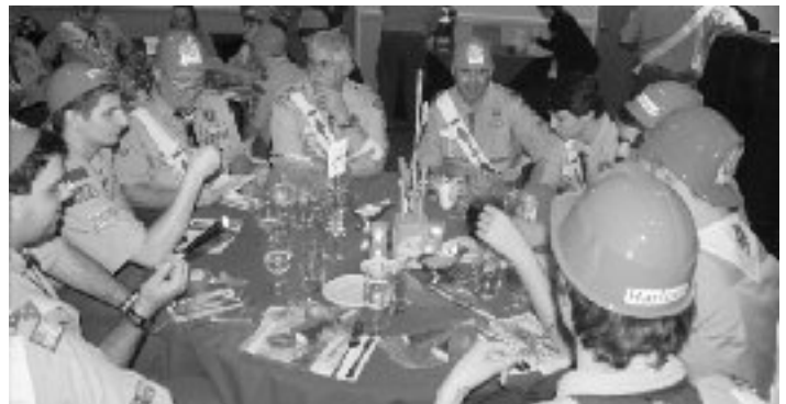
Harford Chapter Table