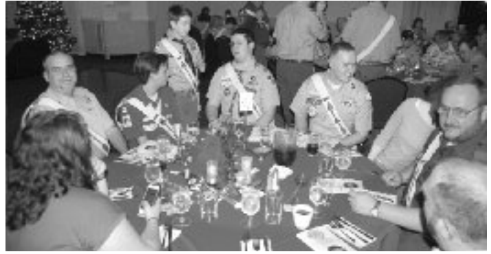
The Capitol Chapter Table