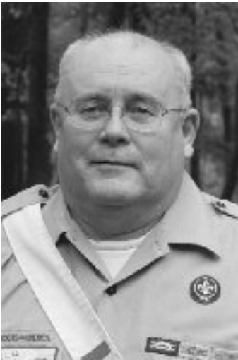
Thomas Hogevoll Lepwe Xuwi Gokhos Wise Old Owl